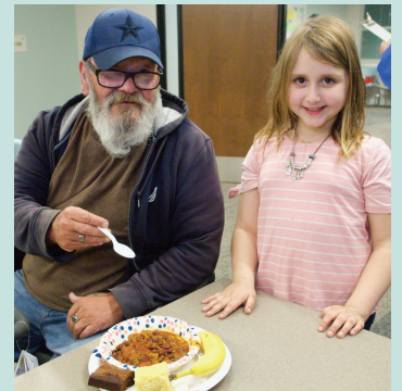
Women of Valor from Oak Hill UMC host Monthly Supper Clubs at Garden Terrace.

You can find out about all these programs and sign up at foundcom.org/volunteer .