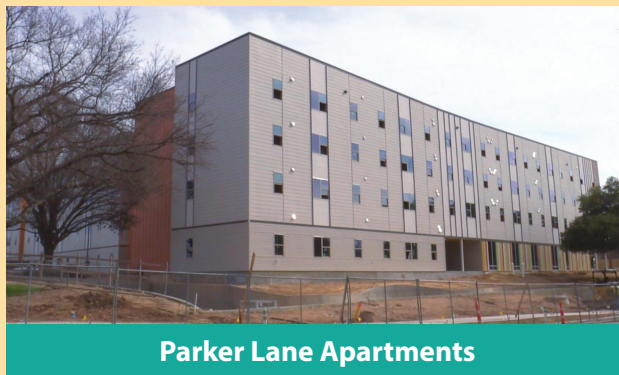
Parker Lane Apartments

Foundation Communities will open two affordable communities this year, Parker Lane Apartments for families and Balcones Terrace for single adults. To apply for this housing, you must get on the interested list.