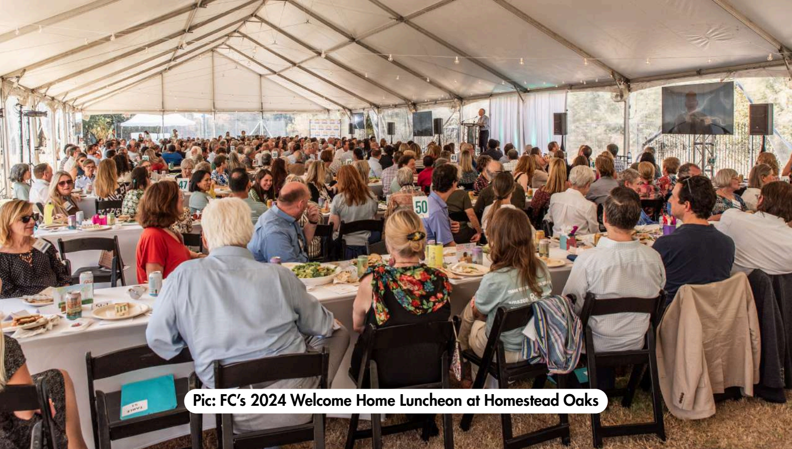
Pic: FC's 2024 Welcome Home Luncheon at Homestead Oaks