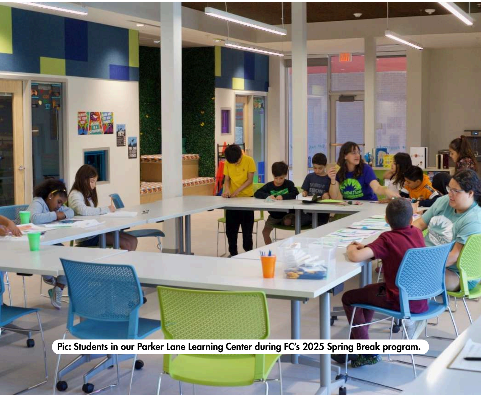
Pic: Students in our Parker Lane Learning Center during FC's 2025 Spring Break program.