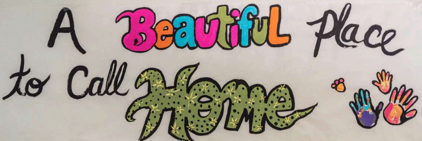
Pic: FC's 2024 Welcome Home Luncheon at Homestead Oaks