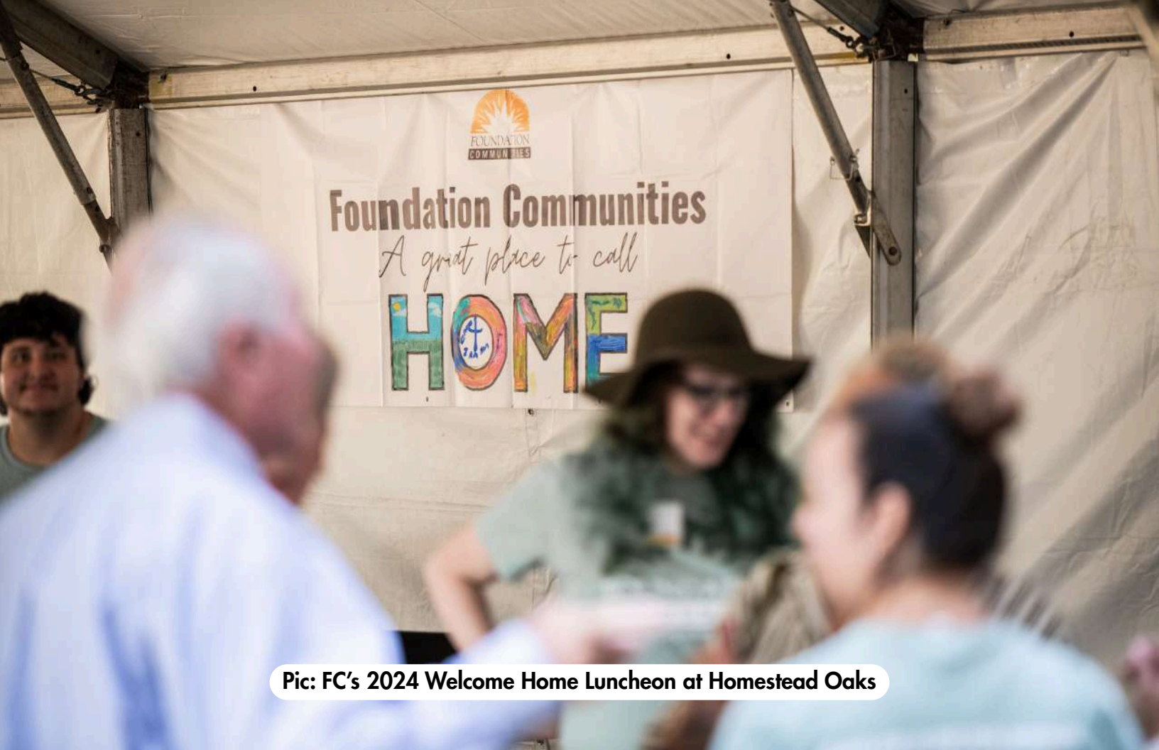
Pic: FC's 2024 Welcome Home Luncheon at Homestead Oaks