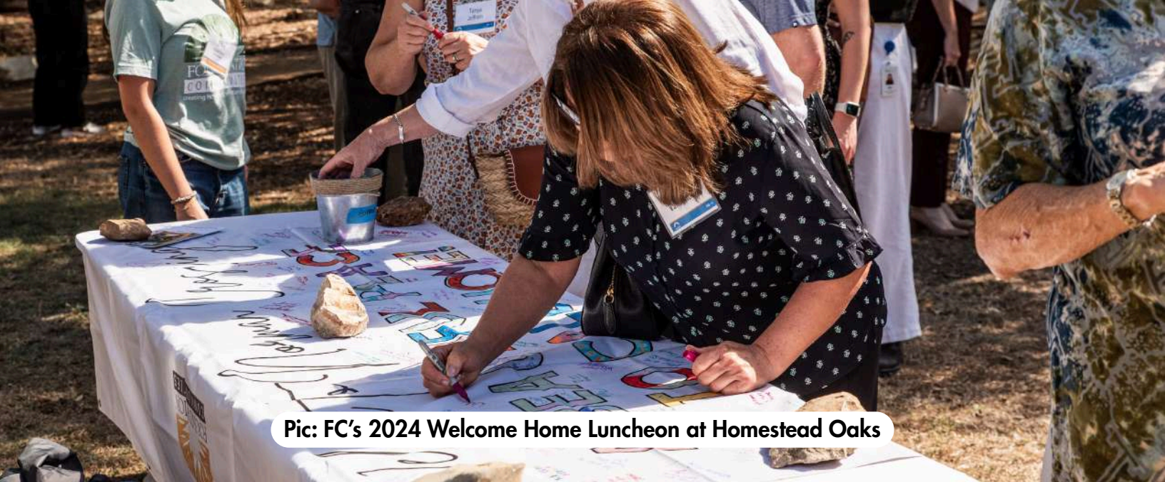
Pic: FC's 2024 Welcome Home Luncheon at Homestead Oaks