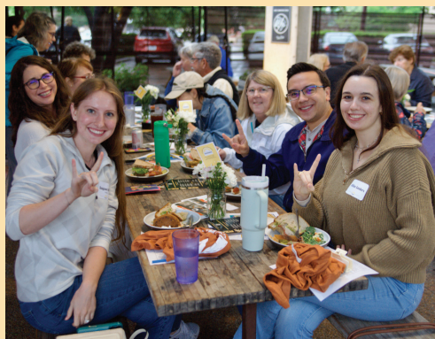
Three UT Students at the Volunteer Party