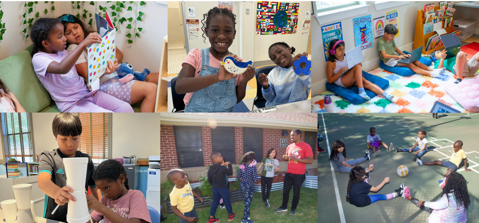
Pic: Students participating in FC's Summer Learning Programs