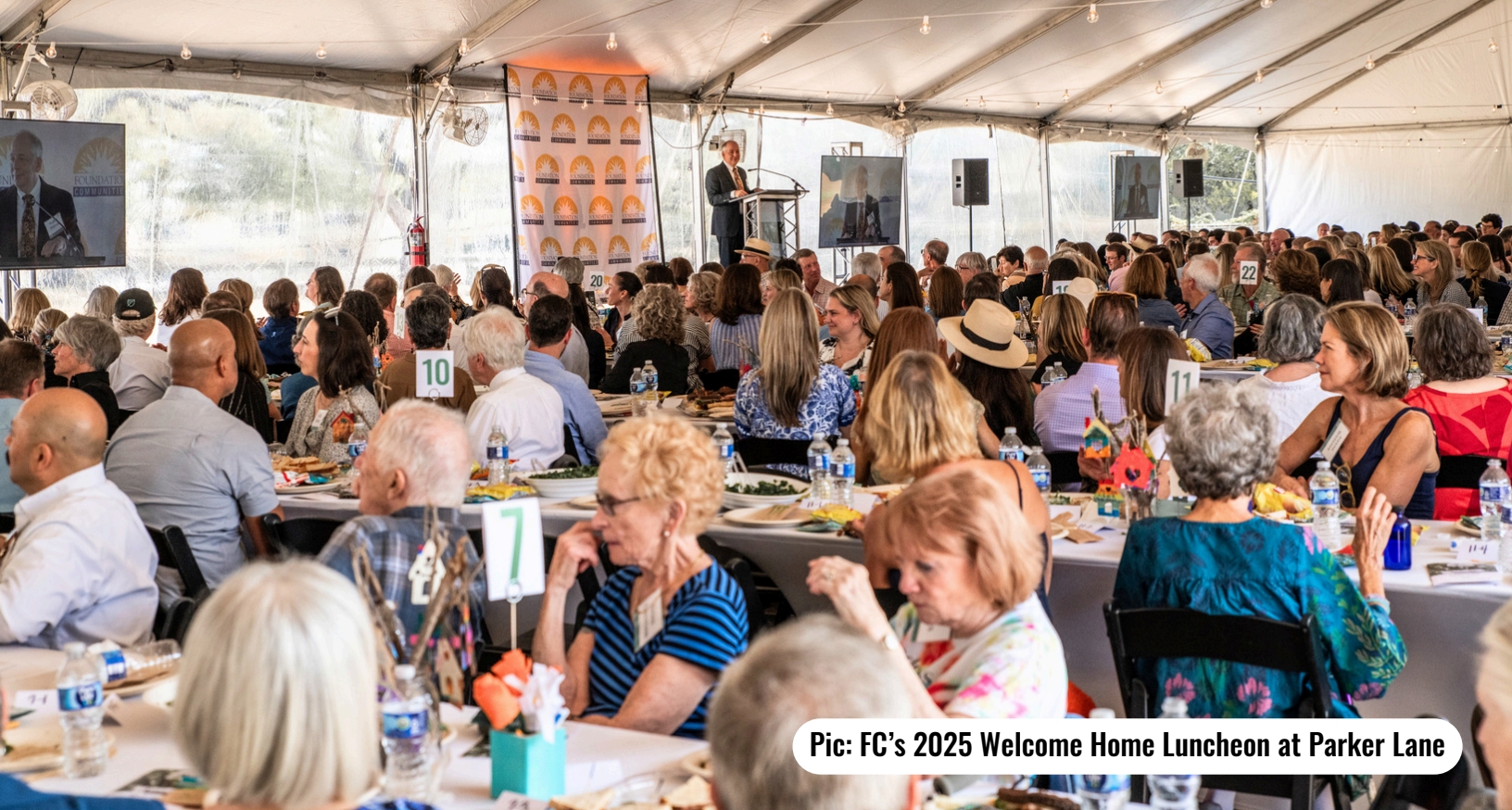
Pic: FC's 2025 Welcome Home Luncheon at Parker Lane